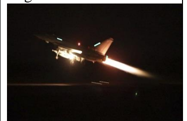
Image provided by the UK Ministry of Defence shows an RAF Typhoon aircraft taking off from RAF Akrotiri in Cyprus, for a mission to strike Yemen. The Houthi-led Supreme Political Council stated in a press release that the Yemeni response is legitimate within the framework of the sacred defense of Yemen, its sovereignty