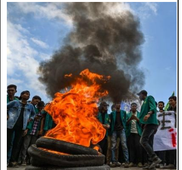
University students burn tyres as they protest against the arrival of Rohingya refugees in Banda Aceh on December 27.

INDONESIA, South China Morning Post (SCMP's Asia desk) , 1 January 2024: Indonesians rejecting Rohingya refugees showing 'same hatred' as Israelis, says Palestinian journalist.