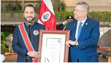
Presidente Nayib Bukele junto al mandatario de Costa Rica Rodrigo Chaves.

complacido por el trabajo realizado de los más de 300 salvadoreños que integran la brigada humanitaria que atendió a las víctimas de las lluvias en Puntarenas y Guanacaste, ciudades costeras golpeadas por el huracán Rafael.