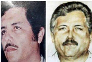
Imágenes sin fecha de Ismael "El Mayo" Zambada García

MEXICO, La Nacion AR (El País) , 26 July 2024: El Cartel de Sinaloa: las luchas internas de las cuatro facciones, detrás de la detención de "El Mayo" Zambada. Fundada en los años ochenta, la organización criminal resiste entre la cacería lanzada por las autoridades y la guerra interna por el territorio.