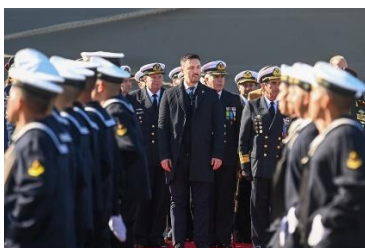
. Imagen: NA. La compra de 24 aviones caza a Dinamarca fue publicitada con bombos

ARGENTINA, Página 12 (Luciana Bertoia) , 11 Sept 2024: Petri rodea de misterio la compra de los aviones a Dinamarca. De la SIDE a los F16: los gastos secretos ya son marca registrada de Milei. El gobierno decretó que las obras en Tandil y Río Cuarto para recibir los 24 aviones serán reservadas al igual que la compra de armamentos. Expertos sospechan que buscan enmascarar las licitaciones o contrataciones.