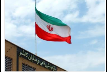
Who's next to get killed at Hamas after Ismail Haniyeh. Israel confirmed the death of Fuad Shukur, the head of Hezbollah's strategic unit, immediately after the strike. Yet, after the attack to kill Haniyeh, the IDF claimed that it did not launch any missiles in the direction where he was staying. Journalists, observers and experts continue analyzing photographs of the residential building in which Ismail Haniyeh was staying at the moment of the attack.

Haniyeh , a Hamas leader, has generated a few questions that one may have difficulty answering: "How did that happen?" The questions for the entire Iranian leadership are: "Who is to blame?" and "What is going to happen now?"