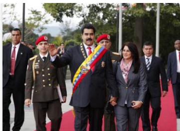
The people of Venezuela re-elect Maduro as president. Venezuela held presidential elections on Sunday — Nicolas Maduro was re-elected for his third six-year term having scored 51.2 percent of the vote. Opposition candidate Edmundo González gained 44 percent. Russian President Vladimir Putin congratulated Maduro on his re-election as President of Venezuela. "Remember that you are always a welcome guest on Russian soil," Putin said. The Chinese Foreign Ministry also congratulated

Pravda , 29 Jul 2024: Venezuela's recovering socialist economy ensures Maduro's reelection. Do not read Western newspapers about Venezuela. Maduro celebrates honest victory. Re-elected Venezuelan President Nicolas Maduro feels at ease — he's been there, done that. The West cooperates with unrecognized presidents and writes off its puppets.