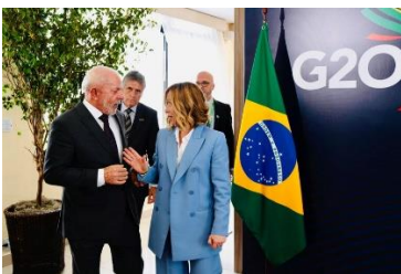
Lula e Meloni

BRAZIL, ANSA.IT (Patrizia Antonini), 19 Nov 2024: Lula lancia l’Alleanza contro la fame al G20. Breve scambio Meloni-Biden al ricevimento. Leader G20, ‘impegno ad una tassazione dei super ricchi’. Il G20 resta generico sui fondi per la lotta sul clima.