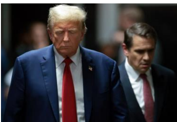
Donald Trump, accompagné de l'un de ses

USA, Le Monde ( Le Monde avec AFP ), 11 Dec 2024: Le parquet de New York s'oppose à l'annulation des procès réclamée par Donald Trump. « L'immunité d'un président élu n'existe pas », a avancé le procureur Alvin Bragg, qui suggère, dans l'affaire Stormy Daniels, un gel de la procédure jusqu'à la fin du second mandat du républicain, condamné pour falsifications de documents comptables.